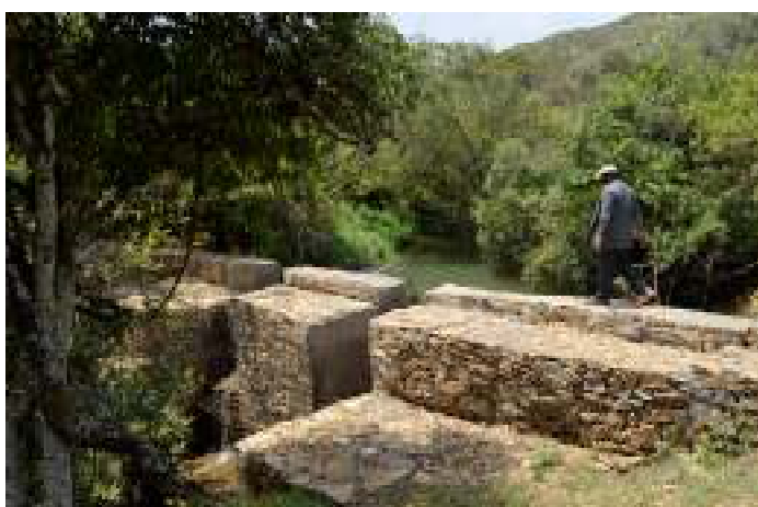
Investment in watershed Management and improved water availability (Abraha Atsebeha Watershed, Tigray, Ethiopia)

Ethiopia has 12 major river basins (including one lake basin and three dry basins) and can be divided into 17 livelihood zones using FAO's mapping methodology (see Project's website). Agriculture is the main driver of the economy, accounting for more than half of the country's production. Over 80 percent of the population live in the regions of Oromia, Amhara and the Southern Nations, Nationalities and People's Region (SNNPR), which together with Tigray are known as the major regions. Given the current favorable policy framework and the government's aim to make agriculture the driver of economic development, community-based watershed management offers a promising water management solution.