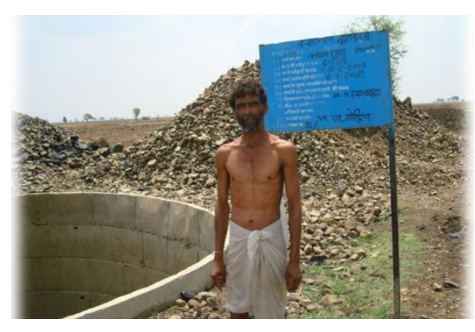
A farmer with a well built on his farm