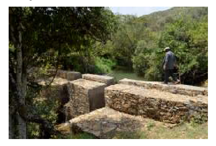
Investment in watershed Management and improved water availability (Abraha Atsebeha Watershed, Tigray, Ethiopia)

Ethiopia has 12 major river basins (including one lake basin and three dry basins) and can be divided into 17 livelihood zones using FAO's mapping methodology (see Project's website). Agriculture is the main driver of the economy, accounting for more than half of the country's production. Over 80 percent of the population live in the regions of Oromia, Amhara and the Southern Nations, Nationalities and People's Region (SNNPR), which together with Tigray are known as the major regions. Given the current favorable policy framework and the government's aim to make agriculture the driver of economic development, community-based watershed management offers a promising water management solution.