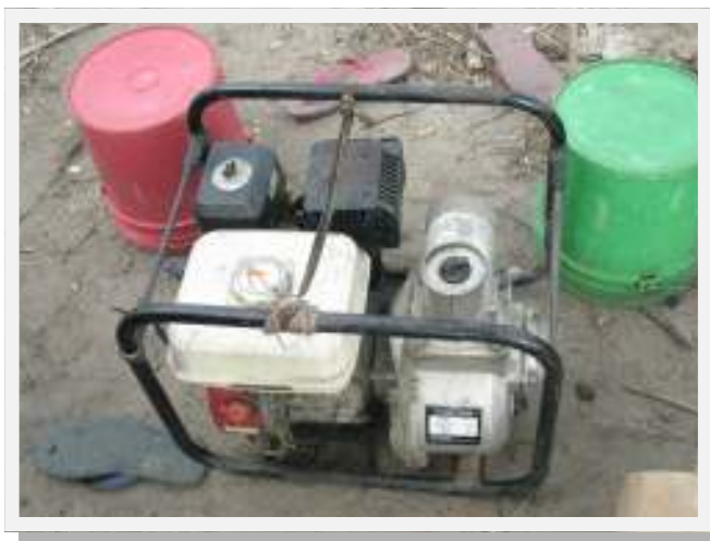
A motor pump can be small, comparatively light and portable

Most motor pumps are imported by private companies, not through public support programs. Despite the involvement of private enterprises, there are insufficient spare parts and