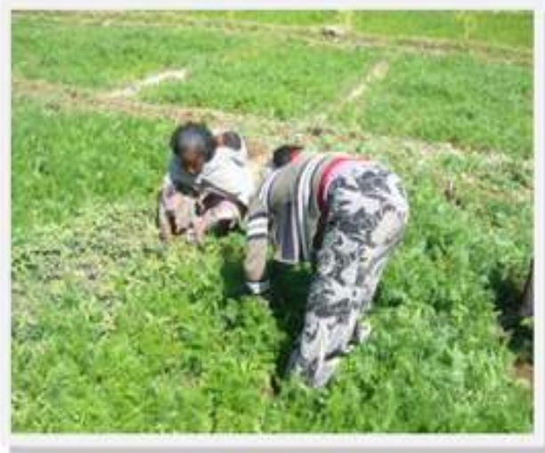
WLTs are usually used to grow marketable crops such as vegetables