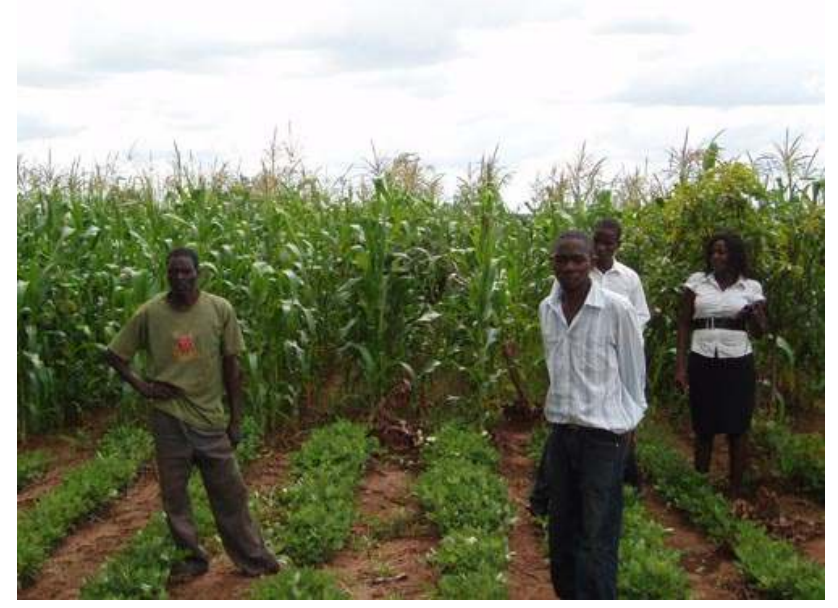
Conserving the water that falls on the soil means famers can grow more and earn more.