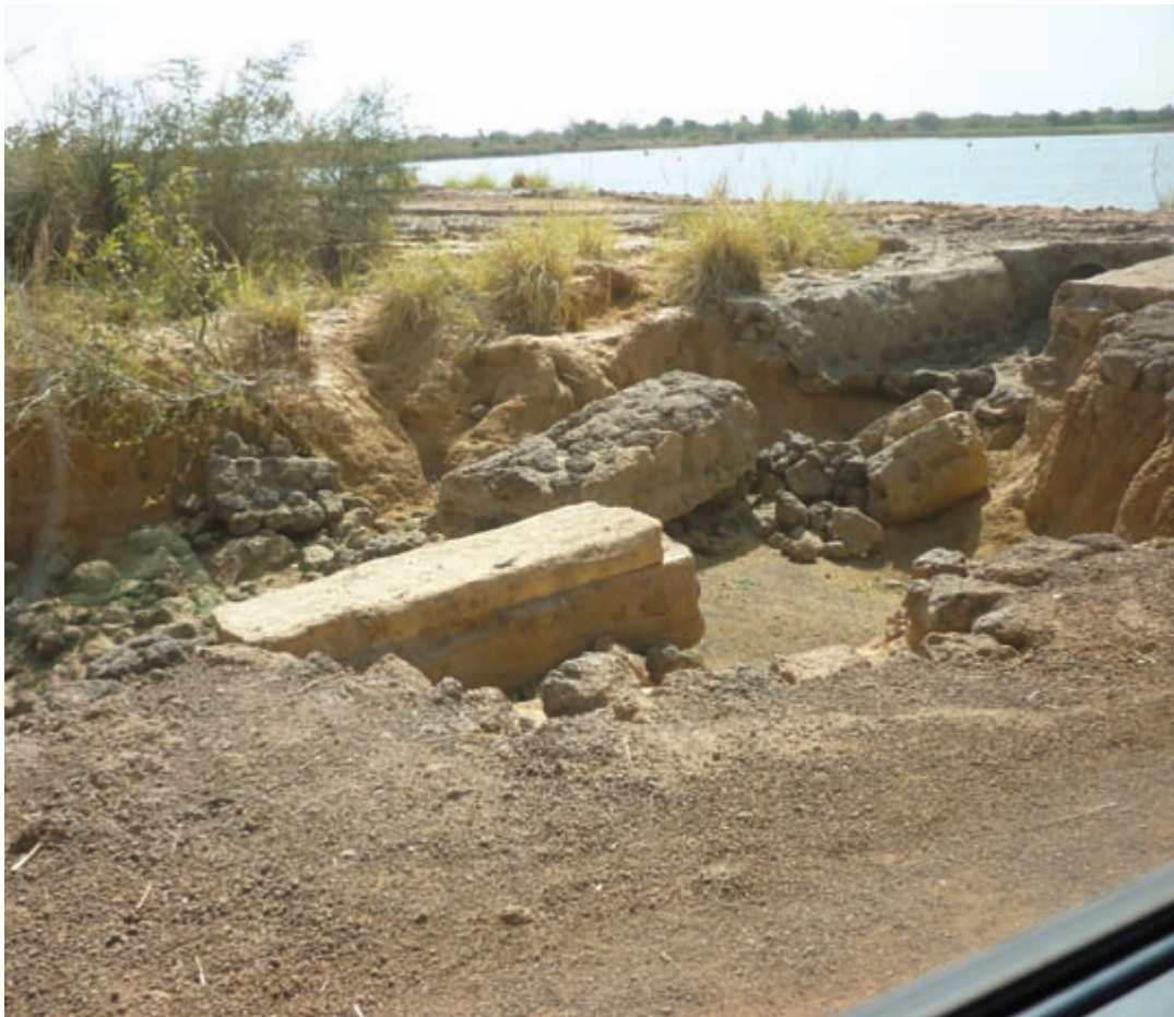
Figure 2: A compromising factor according to the participants: a lack of or weak maintenance of water infrastructures in the watershed