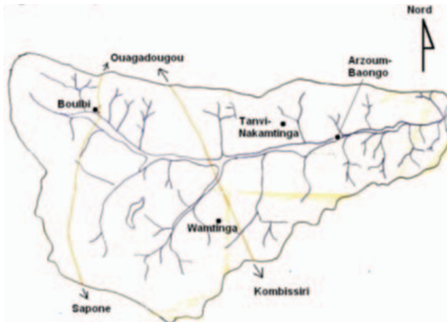
Figure 1: Villages where community level fieldwork has taken place

Previous to the scenario analysis a baseline assessment of the current resource-based livelihood strategies was done 1 . Focus groups were first held in four villages: Arzoum Baongo, Tanvi-Nakamtinga, Wantinga, and Boulbi (see Figure 1) with groups of Farmers concentrating on rainfed agriculture, Farmers utilising irrigation for gardening and agriculture, Pastoralists, and Fishermen. The number of participants is presented in table 1.