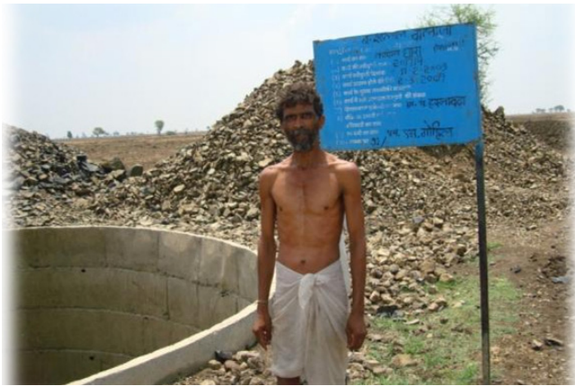
A farmer with a well built on his farm