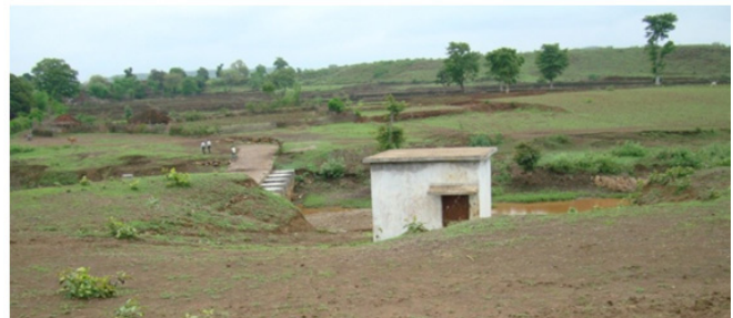
A pump house but no pump to install