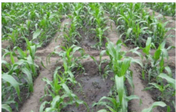
Ridges of earth help to conserve moisture around the plants.

The study was designed to provide information on the adoption of CA techniques, cost of implementation, benefits, and possible investment pathways for out-scaling in Tanzania. It was undertaken in Arumeru District, Arusha Region; and Chamwino and Dodoma Urban districts, Dodoma Region. Interviews were conducted with 200 farmers in eight villages, all of whom had adopted some sort of CA technique. In addition, village, ward and district officials, and two NGOs were interviewed.