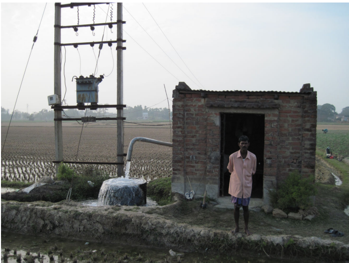
Affordable electricity could dramatically improve the livelihoods of farmers in West Bengal and does not have to deplete the water table.

In response to inadequate water supplies resulting from difficulties in obtaining electricity connections and high diesel prices, West Bengal farmers have reduced cultivation of the lucrative dry-season boro paddy from 1.5-1.6 million ha to 1.2 million ha. Coupled with increased input costs and stagnant output prices, farmers' overall profit margins have decreased and agricultural productivity and living standards have fallen.