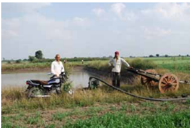
A farmer using a small diesel engine to draw water from his pond

developed by government agencies and NGOs but require pumps to make use of it. They chose diesel pumps because there is limited access to electricity. Pumps are available in the local market for INR 20,000-30,000. Credit is available from government and private lenders. Diesel consumption for these 5 horse power pumps is around 1 liter per hour for 5-6 hours/day depending on soil and crop requirements. Farmers rent out pumps for INR 3,000 per month and payment is made in cash or agricultural produce. On average, pump owners can increase their income by INR 5,000/ha through additional production and INR 10,000 from pump rental fees.